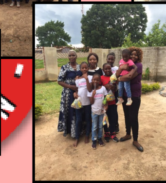
Christmas Dinner with our Social Workers! (3 pictures to the left)